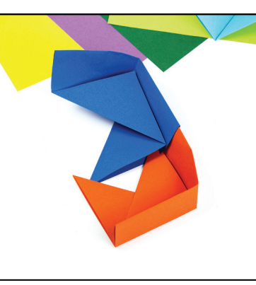
8. Now, it's getting a little finicky. Open the left element on the right side and slide in the right element a little bit.