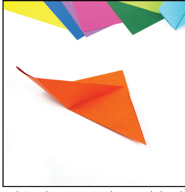
6. Bring the upper tip down and thereby open up the shape.