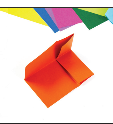
4. Fold along the vertical middle line and then unfold it again.

3. Fold the upper edge to the line in the middle.