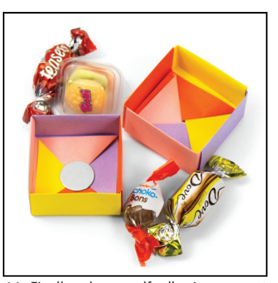
14. Finally, glue a self-adhesive magnet S-20-01-STIC inside on the box bottoms.