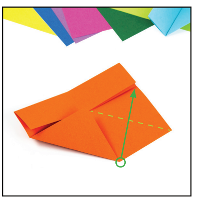
5. Place the bottom tip on the marked spot. Only press down on the crease along the marked line.