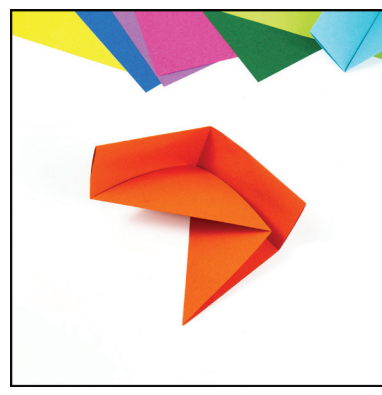
7. And that's it! Repeat three times with the other sheets.