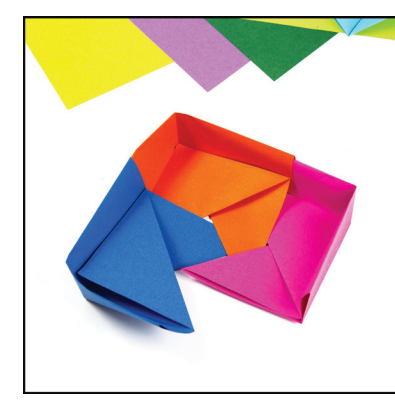
9. Slide in the other elements the same way from the right until all of them are intertwined.