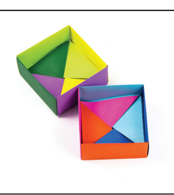
13. That's what it's supposed to look like from the inside.