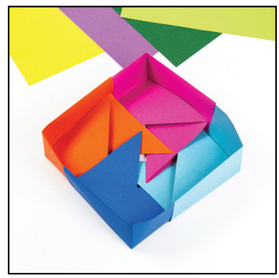
10. Arrange the tips in the middle so they are spiral on top of each other. It helps to turn the object around.