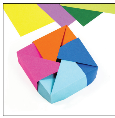
11. Press down the tips with your finger so you can't see them anymore.