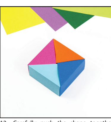
12. Carefully push the shape together from all sides. Done! Now you only have to repeat this process 47 more times ;-)