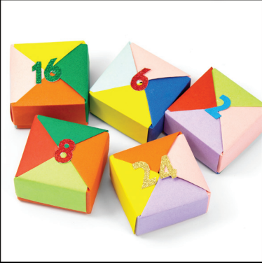
15. Glue the numbers 1 - 24 on the completed boxes.